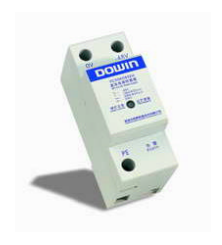
YD30K085EH lightning protector for DC power supply